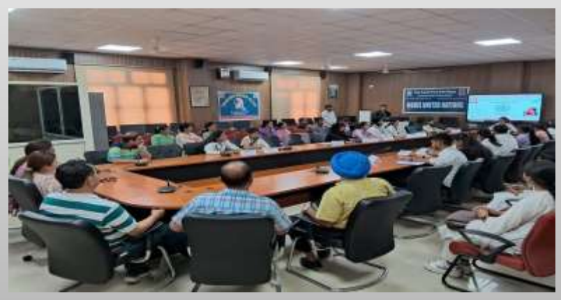
Model United Nations Event to Commemorate International Day of United Nations Peace-keepers