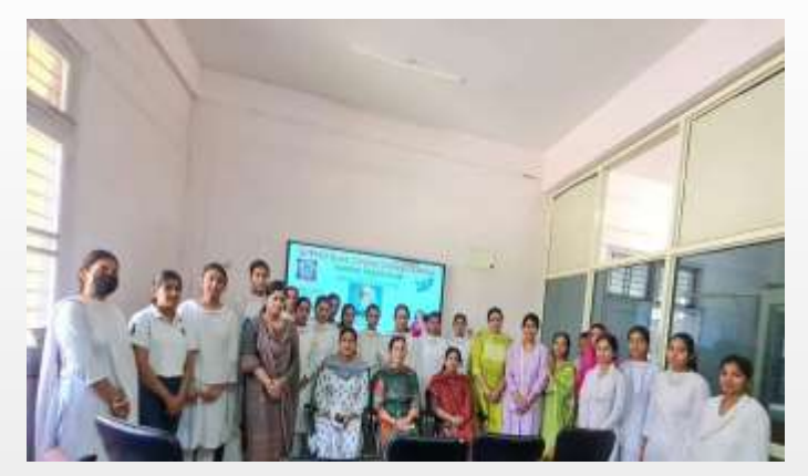
Extempore on "Global Peace and Education"